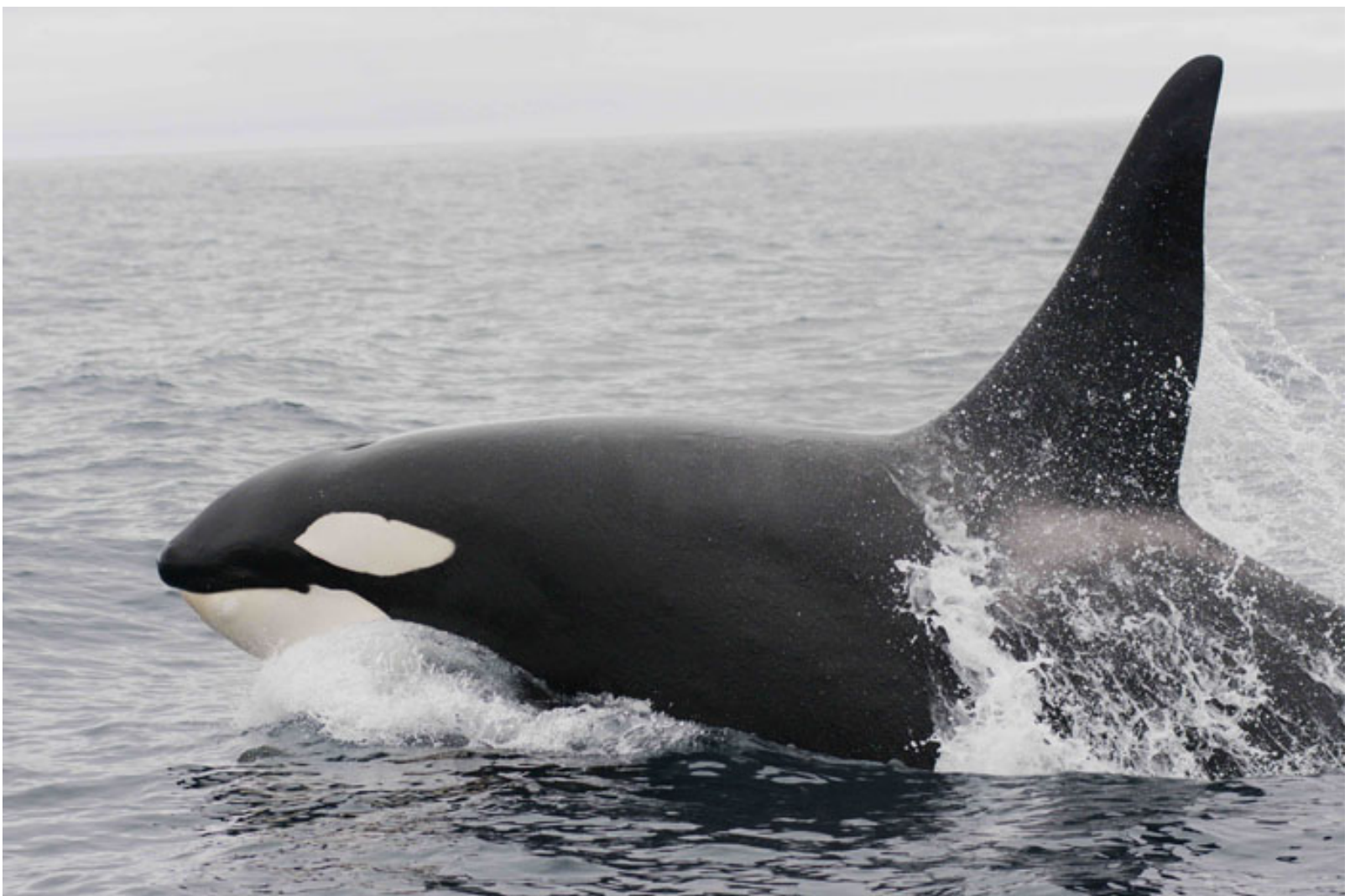
KILLER WHALES BELONG TO THEIR HOME IN THE OCEAN.