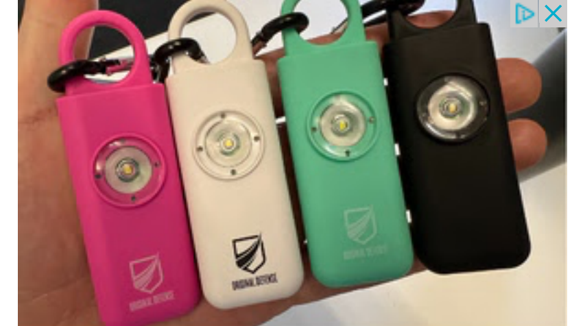
Police Urge Everyone To Carry This Device